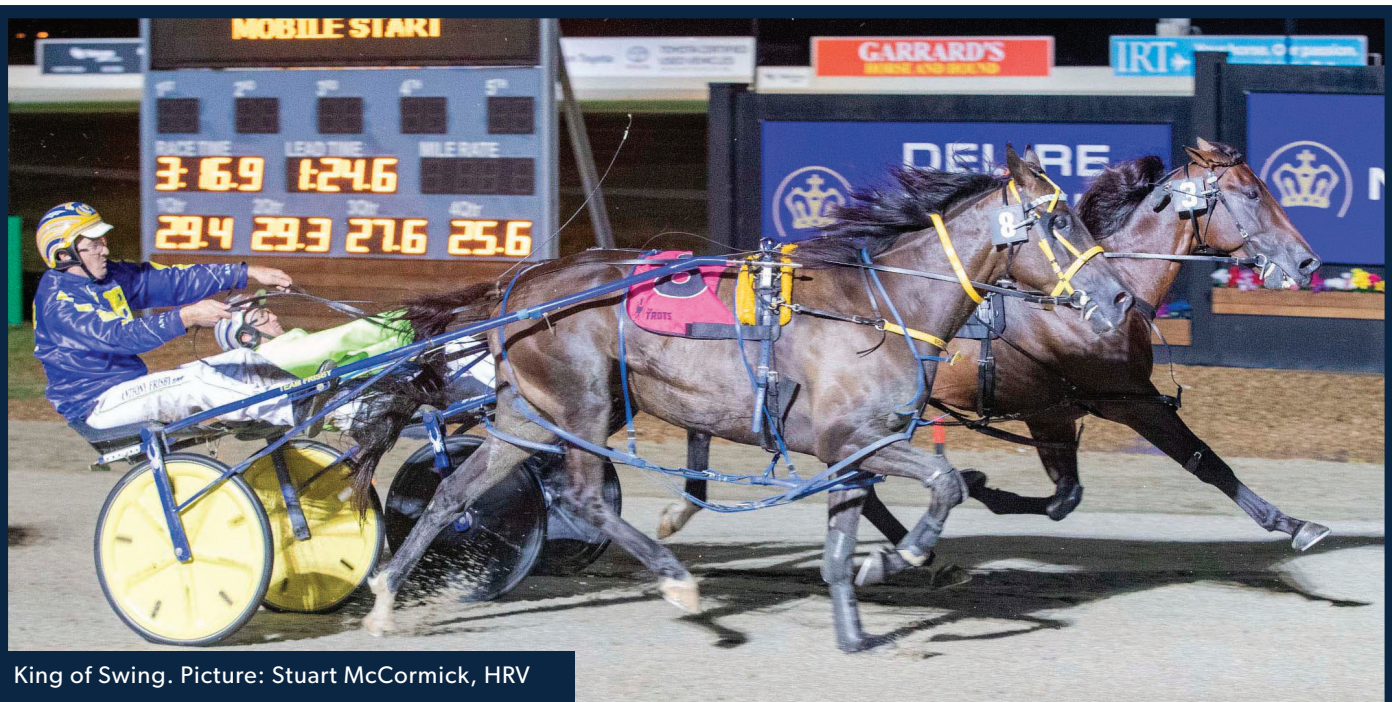
King of Swing.