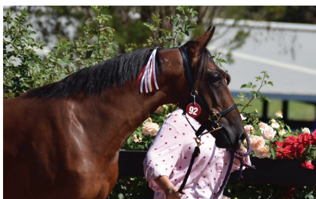
Cover: APG Melbourne Sale