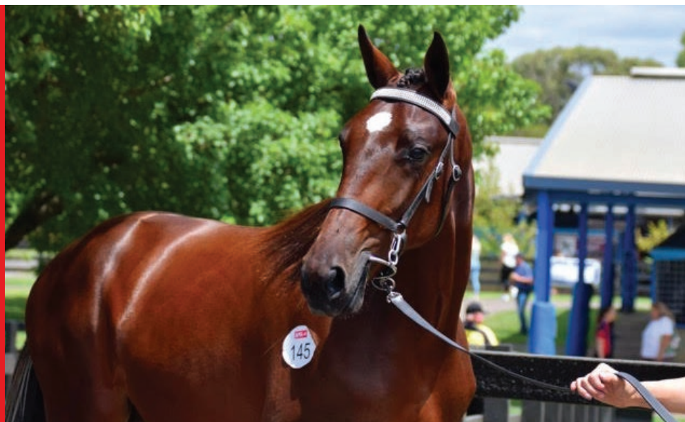
Always B Miki-Jazzam colt.