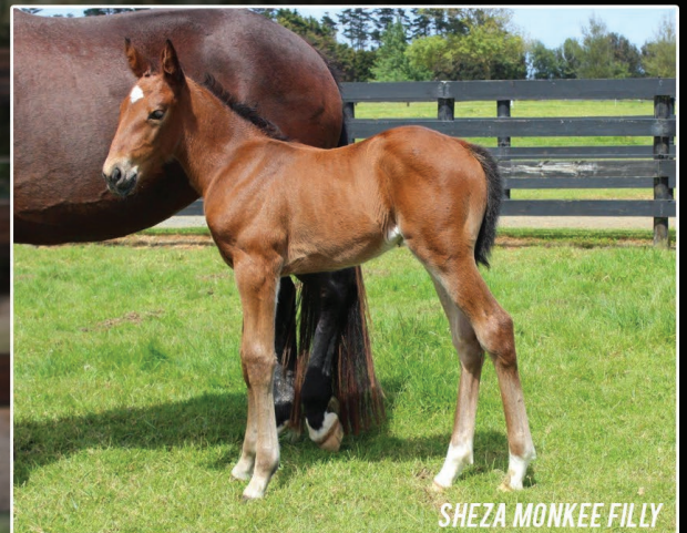
SHEZA MONKEE FILLY