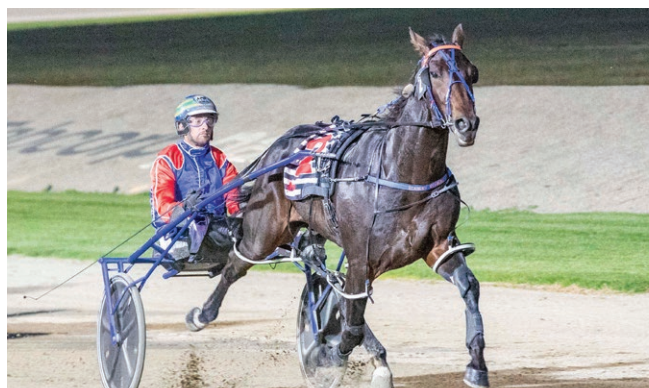
Bar Boom Banta

Father Patrick US-Keayang Yankee (Muscles Yankee US) trotting filly Bred by Levarg Racing Group