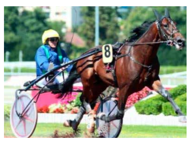
Trackbred July 2020 | 11

He will available to Australian breeders for the first time via frozen semen through the Victorian-based Haras des Trotteurs.