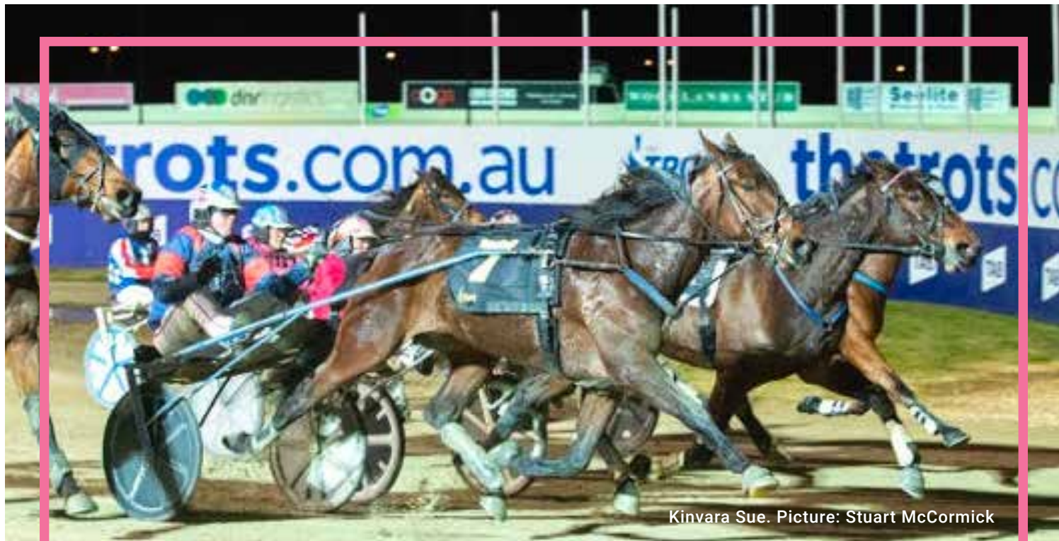
Kinvara Sue.