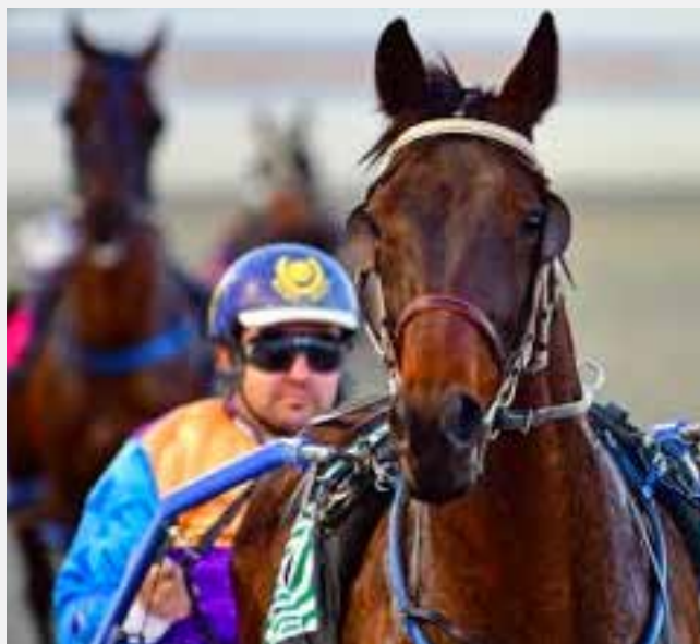
Bettor Party.