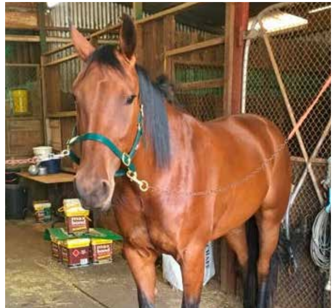
In A Minute looked fresh the day after her first win

The timing of Dream A Minute's win could hardly have