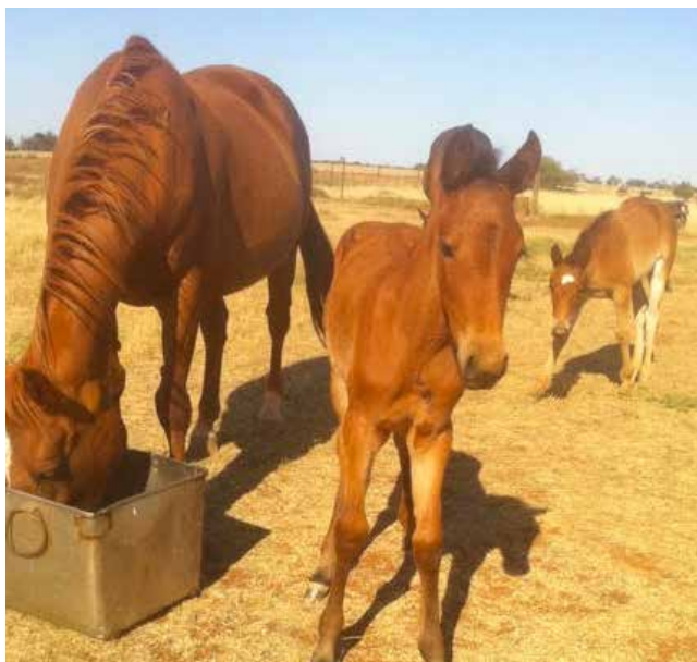
In A Minute as a foal

Each of the two mares had just three starts without notching up a win. However, Carmen Belle also left