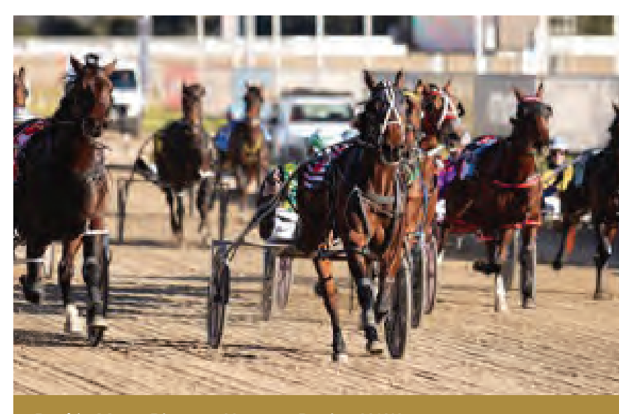
Rockin Marty

He is a full and half brother to seven winners, including 2011 group 1 Bathurst Gold Crown winner and three-time group 1 placed Soho Valencia (by Art Major) 21 wins, $332,000, Wardan Express (Art Major) 15 wins, 195,000 and group 1 2014 Vicbred Super Series and Victoria Oaks winner Niki No No (Sportswriter) 14 wins, $294,000.